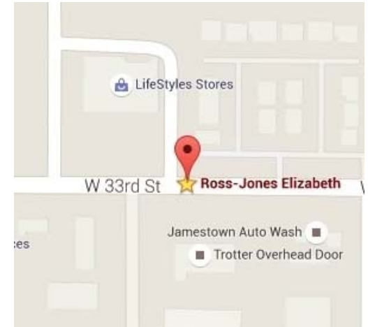
ROSS-JONES LAW OFFICE LOCATION

One-Hour Initial Consultations are always free at my law office for parents of special needs children! I'm happy to answer your questions.